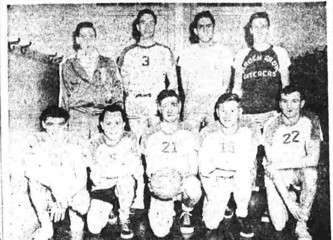
Pictured above are members of the Garden Grove Outdoors, champions of the Rec Senior Basketball League during the 1950-51 season. The Outdoors were led by the management at a banquet last night at the Garden Grove.